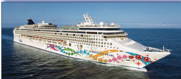
Norwegian Cruise Line, Norwegian Pearl

15 days, transiting the Panama Canal October 5 - 20, 2016