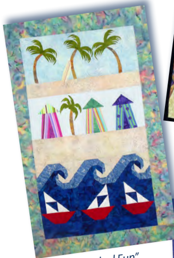
"Tropical Fun" "Beginners" Row quilt by Janice LaGrone

Cruise along with three expert teachers for classes, shore excursions, travel adventure and lots of quilting fun!