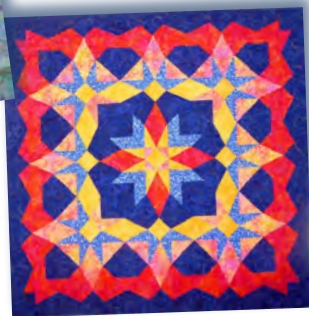
"Red Sky at Morning" Storm at Sea Variation by Wendy Mathson